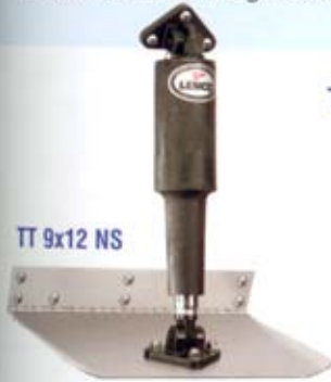
TT 9x12 NS