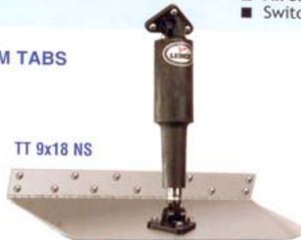
TT 9x18 NS