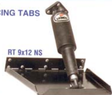
RT 9x12 NS

9" x 9" (Lenco #TT 9X9 NS) 14-18' boat ORDER NO. 288-09090 9" x 12" (Lenco #TT 9X12 NS) 16-25' boat ORDER NO. 288-09120 9" x 18" (Lenco #TT 9X18 NS) 22-30' boat ORDER NO. 288-09180