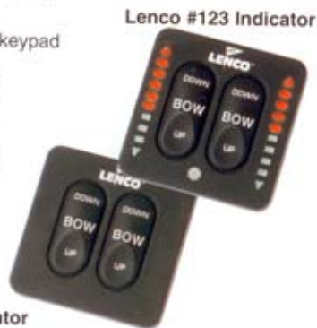
Lenco #124 Indicator

Lenco Standard Switch ORDER NO. 288-01240