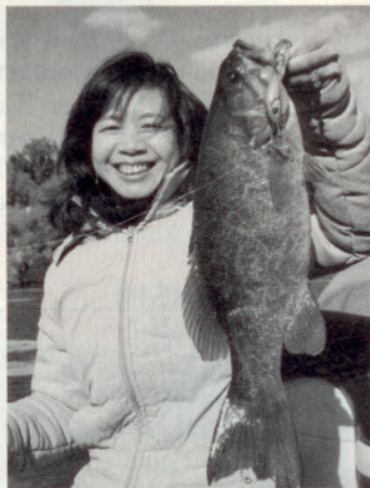
Catching Fish with Salmo Lures is becoming a favorite past time with American Anglers. All Salmo lures sold in America have a Lifetime Performance Guarantee.

The Performance Guarantee is simple, if for any reason your Salmo lure fails to run true or breaks, send it back to Salmo USA and you will get a replacement free of charge. Of course the guarantee does not cover hooks or O-rings, but if you cast the lure into a sea wall by mistake, Salmo will replace it! Amazing, but true, and no other crankbait company in the world is willing to make this claim! There is little doubt, Salmo will be a major player in the crankbait market with a performance guarantee like this. To learn more visit www.salmofishing.com .